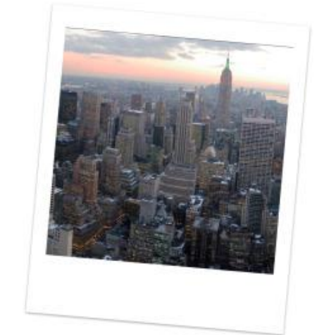
(ABOVE) - BioLogos will host its first workshop in the heart of New York City.

To conclude the event, participants will write a statement on the next steps toward fostering a thoughtful dialog between science and religion. The foundation hopes this meeting will serve