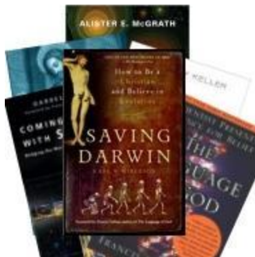
(ABOVE) - Saving Darwin will be the focus of the first BioLogos book club meetings.

BioLogos looks forward to expanding this book club program in the future. Those interested in participating or in organizing a local book club may contact The BioLogos Foundation for more information.