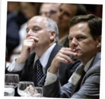
(ABOVE AND BELOW) - The BioLogos Foundation hopes to recruit guests from its launch event in April to be part of the President's Circle.